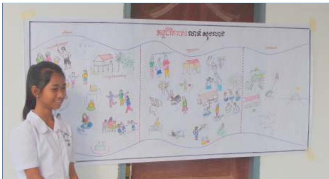
The "River of Life" exercise in Cambodia